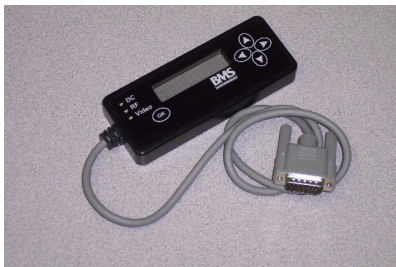
CCII-REM - Remote Control